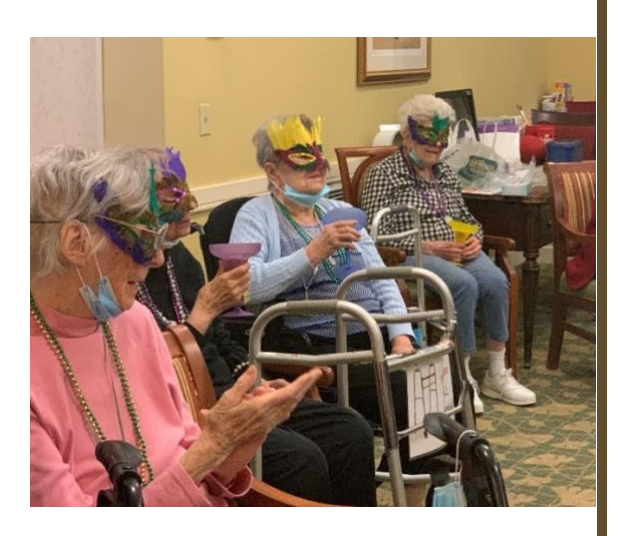
Mardi Gras at Grace House

Byron House residents celebrate Valentine's Day in style. A beautifully decorated dining room covered in hearts and roses set the stage for a party full of sweets. The highlight of the party included themed red and pink pastries made with love.